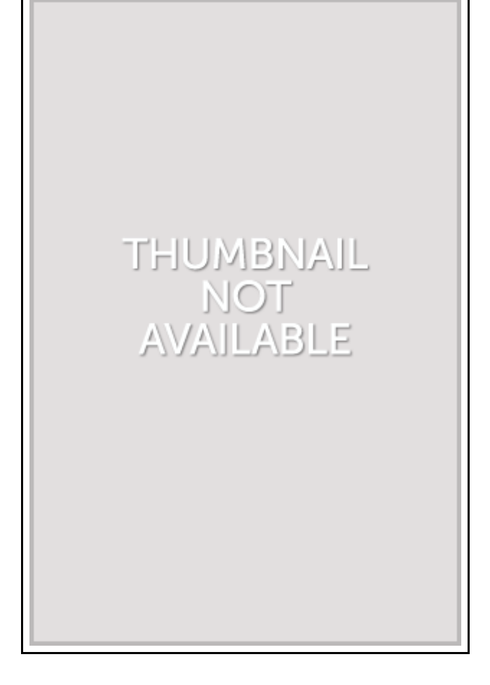
Filesize: 4 MB